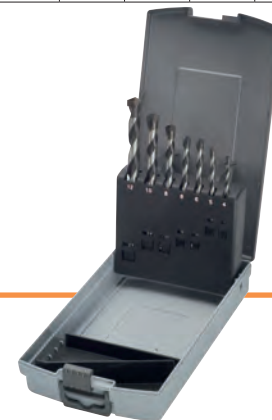
B 3630 /7 sz.7