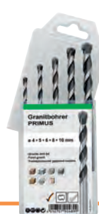
B 3630 /7 sz.5