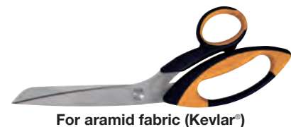
For aramid fabric (Kevlar®)