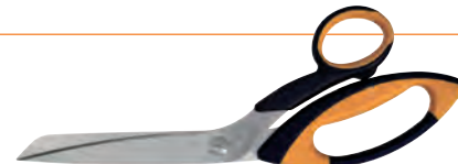
For fiberglass and carbon fiber