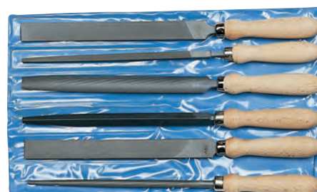
D 2608/5 - D 2608/6