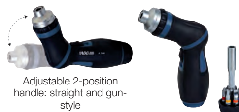
Adjustable 2-position handle: straight and gun-style