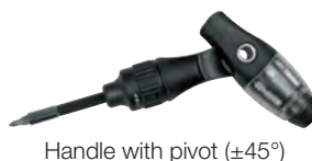
Handle with pivot ( \pm 45^\circ )