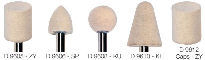
D 9605 - ZY

D 9612 - Spare felt polishing points - ZY - For shank Ø 3 mm