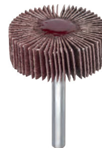
Corundum with abrasive bonding for stainless steel