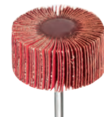
Ceramic coated version