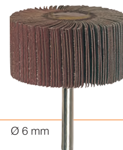
Ø 6 mm