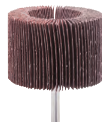
Version for front and side use