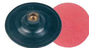
Fixing on fabric with hooks «Velcro» type

Fibre discs in corundum abrasive paper with hole configuration for orbital sanders