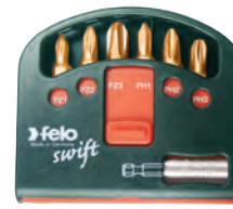
A 1593/25 - TiN