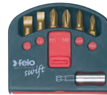
A 1593/35 - TiN