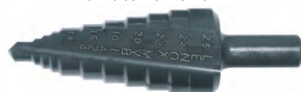
For holes max. Ø 24 mm