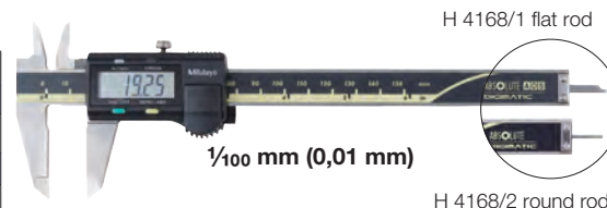
H 4168/1 flat rod

Calipers with sensor that allows a higher measurement accuracy, without false reading in difficult environmental working situation, like the presence of dirt, oil and water