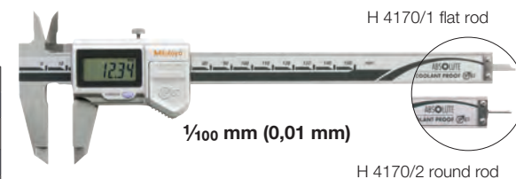
H 4170/1 flat rod