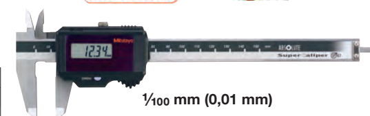
1/100 mm (0,01 mm)