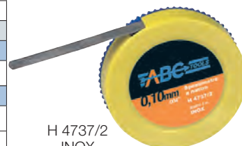
H 4737/2 INOX

Handle for feeler gauge tape, in tempered steel