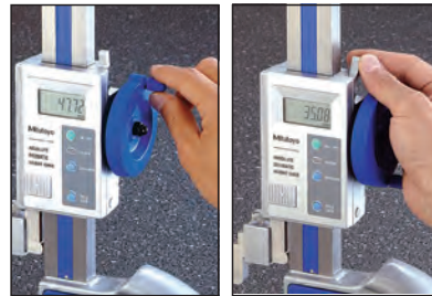
Handle for moving the slide

Prepared for data output "Digimatic" with cable H 4845/6