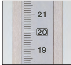
Matt chromed vernier scale