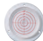
\varnothing 80 mm