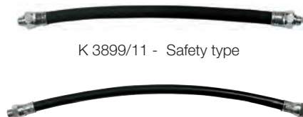
K 3899/11 - Safety type