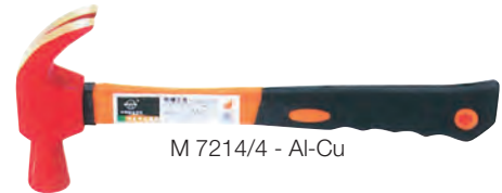
M 7214/4 - Al-Cu