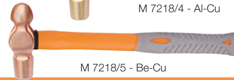
M 7218/5 - Be-Cu