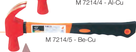
M 7214/5 - Be-Cu

Type with square striking surface and symmetrical pen