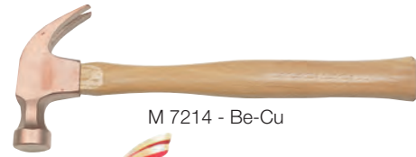
M 7214 - Be-Cu