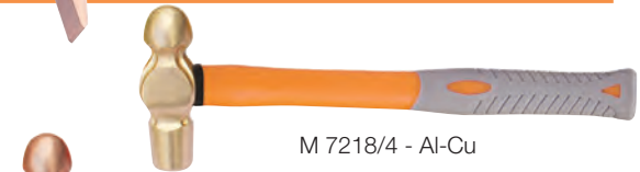
M 7218/4 - Al-Cu