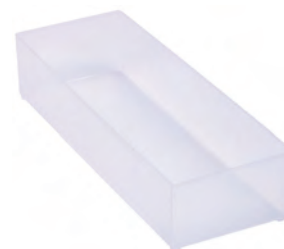
AxBxh 218x79x47 mm