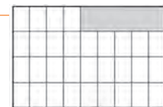
Example of use in BOXXSER® boxes