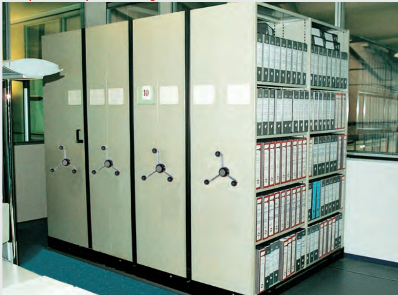
Mobile shelving for offices, banks, insurance companies, public facilities, etc.

Binders, folders, records, discs, and everything required for archiving in a modern and organised office.