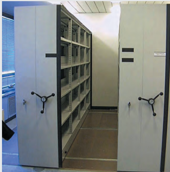
Mobile shelving for warehouses, laboratories, etc.

Binders, folders, records, discs, and everything required for archiving in a modern and organised office.